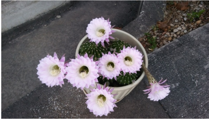
The Cactus at Church Were in Full Bloom on Monday, August 3