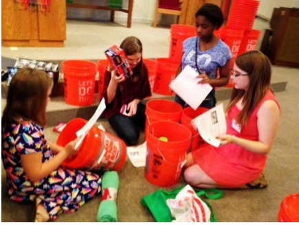
Buckets assembled Faith UCC in New Braunfels