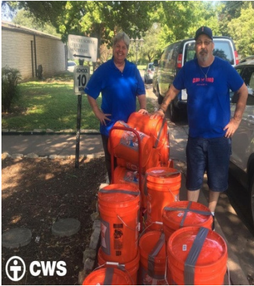
Buckets go to Austin