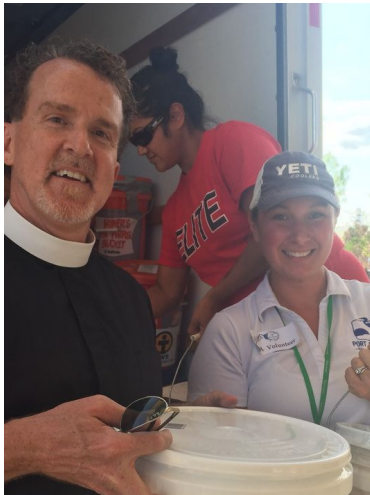
St. Paul UCC distributes in the Rockport area

The buckets address short term emergency needs but the UCC works primarily in long term recovery. Long after the hurricanes fade from the headlines and the world has moved on to new disasters the UCC and other churches will still there helping people in storm ravaged areas.